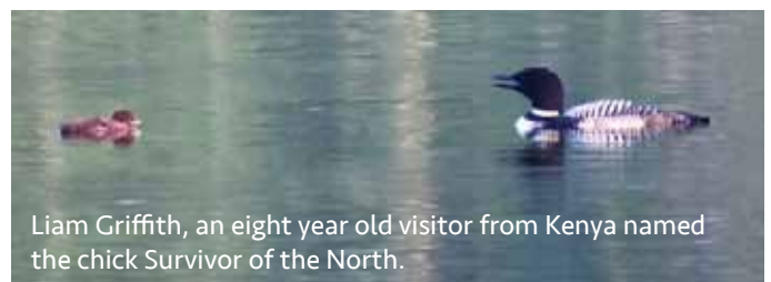
Liam Griffith, an eight year old visitor from Kenya named the chick Survivor of the North.

Ospreys - The Osprey fledged at least two, possibly three chicks this year. Interesting facts from US Fish & Wildlife Service: Osprey incubate eggs for 1 month and make their first flight 60 days after hatching. After staying with their parents for up to 2 months, young osprey make their first migration alone, instinctively knowing where to go without following their parents.